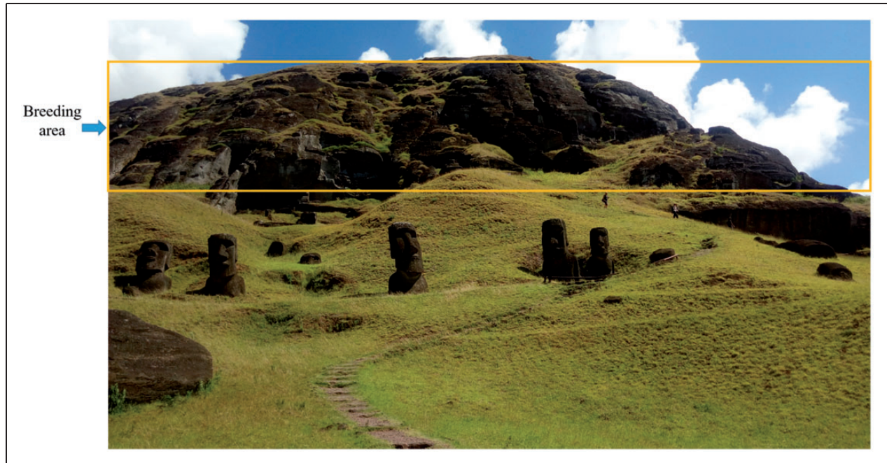
Figure 1. Rano Raraku volcano at Rapa Nui. The square indicates part of the breeding area that was surveyed and where experimental eggs were placed at empty red-tailed tropicbird nests.