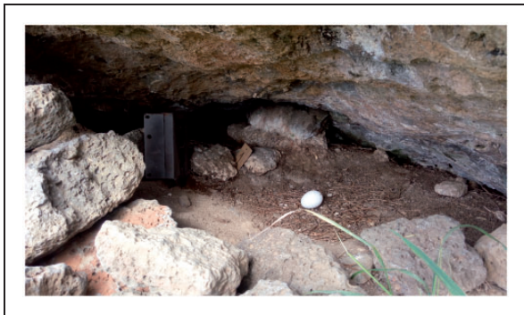
Figure 2. One of the empty red-tailed tropicbird nests at Rano Raraku used in this study showing an experimental egg and a Bushnell Camera Trap.

were empty but recently used as confirmed by the presence of feces, down, and feathers (personal observation). On November 20, 2016, three hen eggs of free-living birds raised at Rano Raraku were placed in three of the empty nests (one egg per nest). Each experimental egg was monitored by a Bushnell Camera Trap settled in each nest to record the visits and behavior of potential predators (Figure 2). The following day, nests were checked in the morning and evening to attempt to determine diurnal and nocturnal predators. None of the eggs were depredated. After each inspection, eggs and cameras were changed to other nests. On the second day, the same procedure was performed. Again, none of the eggs were depredated. Therefore, on the third day, eggs and cameras were